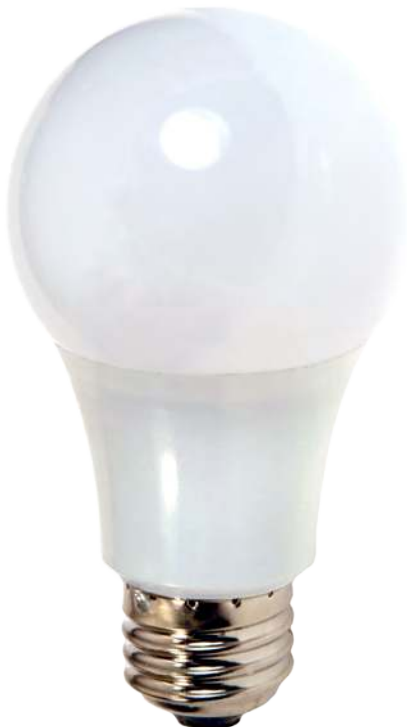
LED15 A19 15W 120V(60Hz) A19 Shape 150° Beamspread E26 Base